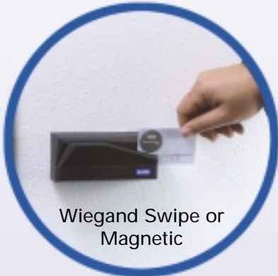
Wiegand Swipe or Magnetic