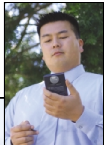
Attaches easily to cell phones, PDAs, and other objects.